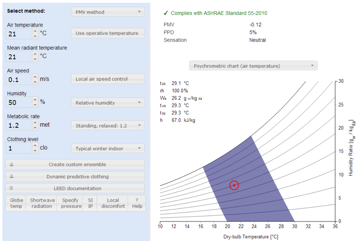
Figure 1 - Pure Convection Home

We’re going to have to get a bit technical here, so bear with me as we calculate two different home environments: first for a home with purely convection heating. Using this calculator, we can find that typical indoor air temperatures of 21°C (and assuming equilibrium with radiant objects in the room of 21°C), produces good thermal comfort as shown in Figure 1.